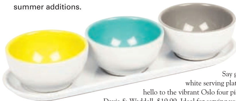
Say goodbye to boring white serving plates and bowls and hello to the vibrant Oslo four piece bowl set from Davis & Waddell, $19.99. Ideal for serving your favourite party dips, the coloured bowls are also handy for remembering which dip is which!

Entertain in style this party season with these fabulous summer additions.