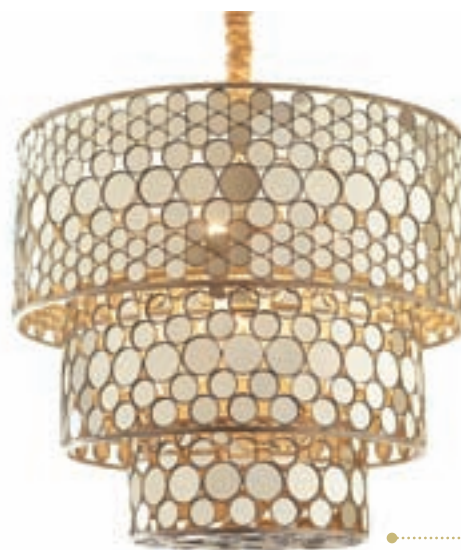
The striking Solara chandelier by Janice Minor, $2200, is like the icing on the interior cake. Hang it over the dining table, above the kitchen bench or in the entrance to your home – wherever this little beauty finds its home, it's sure to surprise and delight. Available from Exhibit Interiors.

Cool and contemporary, the stunning Phillip Jeffries Tease wallpaper in teal from The Textile Company will provide your interior with an instant 'wow' factor. For shock value, use it in otherwise boring rooms like the bathroom or laundry.