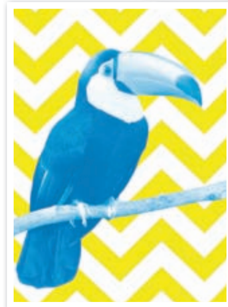
Ideal for adding colour to a neutral interior, the Toucan Canvas from Wall Studio brings together three of the latest trends – chevron, birds and the combination of blue, yellow and white. From $89, the artwork is printed on 100 per cent cotton canvas and ready to hang.