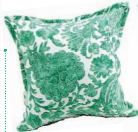
The beautiful Emerald Green Batik cushion from Bungalow Living, $52, is perfect for refreshing a tired, old sofa. Team it with some additional bright cushions in pink, blue, yellow and orange.

The South Beach Adirondack chair, $499, is ideal for relaxing in the sun. With its spacious and comfortable seat and retractable footrest you'll never want to get up! Made from eco-friendly recycled materials the chair is weather resistant and the green colour will look best in homes with cement, paved or timber deck outdoor areas.